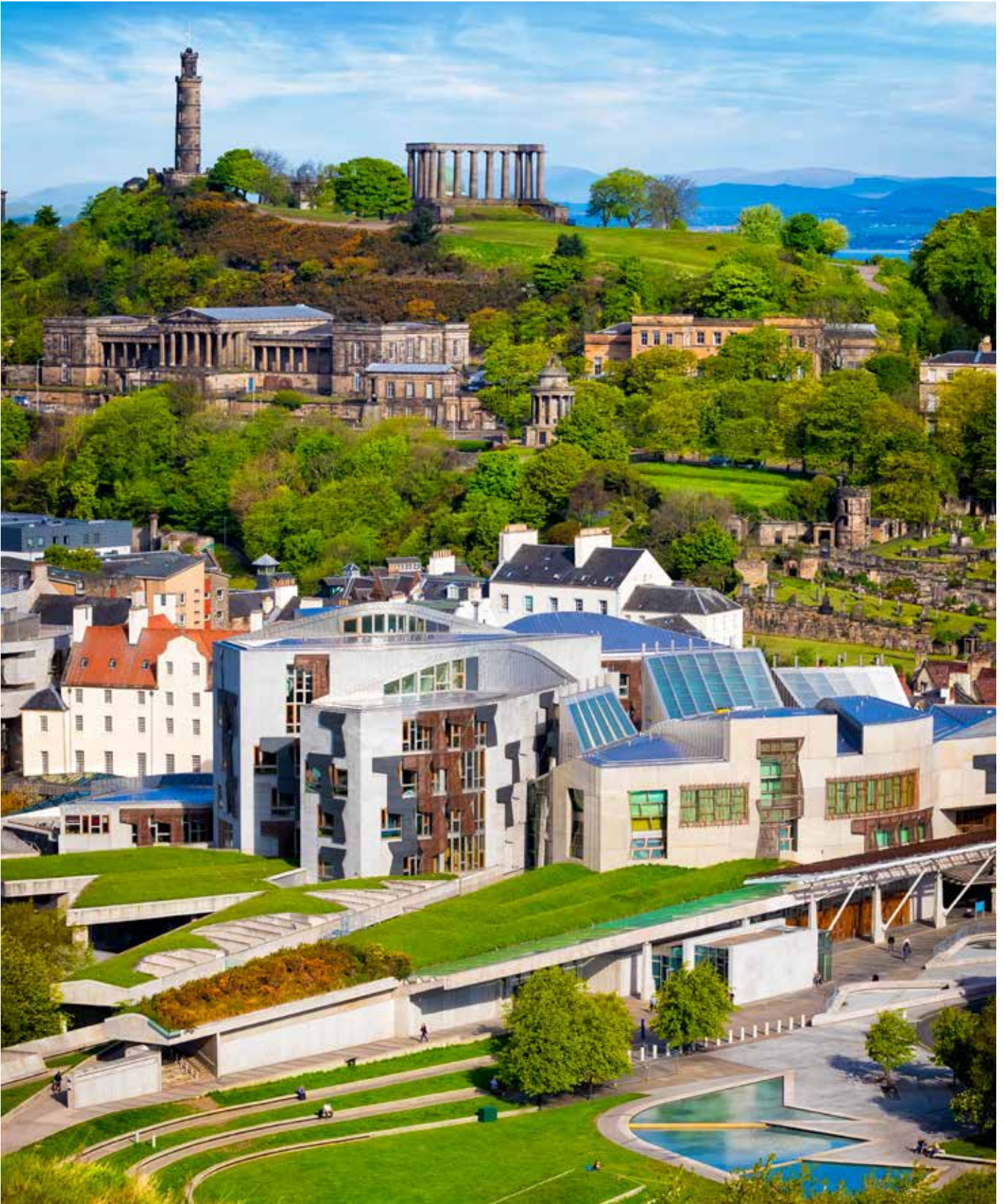
The Scottish Parliament, Holyrood, Edinburgh