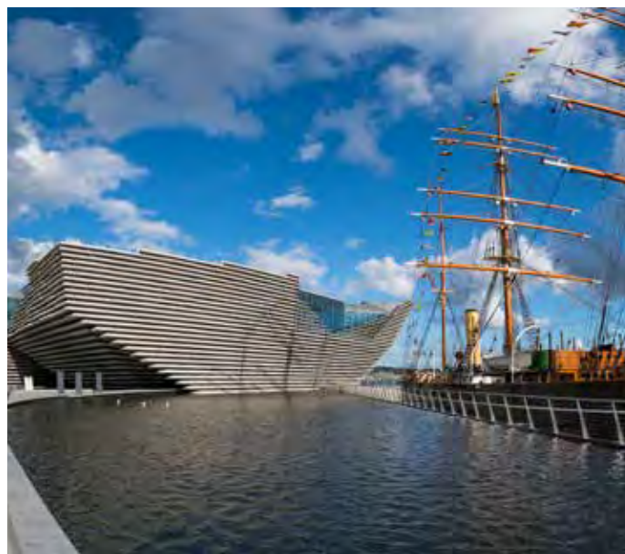
V&A Museum, Dundee

Realising the huge potential of the digital economy must be a priority. Commission President von der Leyen rightly said that “Europe has all the scientists and all the industrial capabilities it needs to be competitive in the digital area. Innovation needs brains. But it also needs diversity and space to think. We have all that here in Europe.”