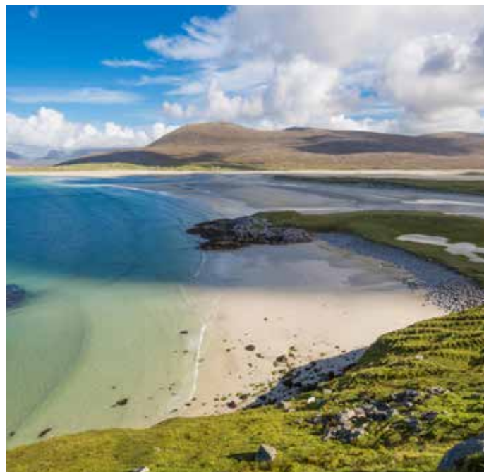
Seilebost, Luskentyre Sands, Isle of Harris, Outer Hebrides

Linked to this goal, the protection of the wider environment must be an overarching priority. This includes the EU taking a leadership position, globally, in halting the alarming loss of species biodiversity (including in its contribution to setting ambitious targets for biodiversity at COP 15 in Kunming, China), setting a 'zero-pollution' target, tackling environmental crime and delivering on the circular economy.