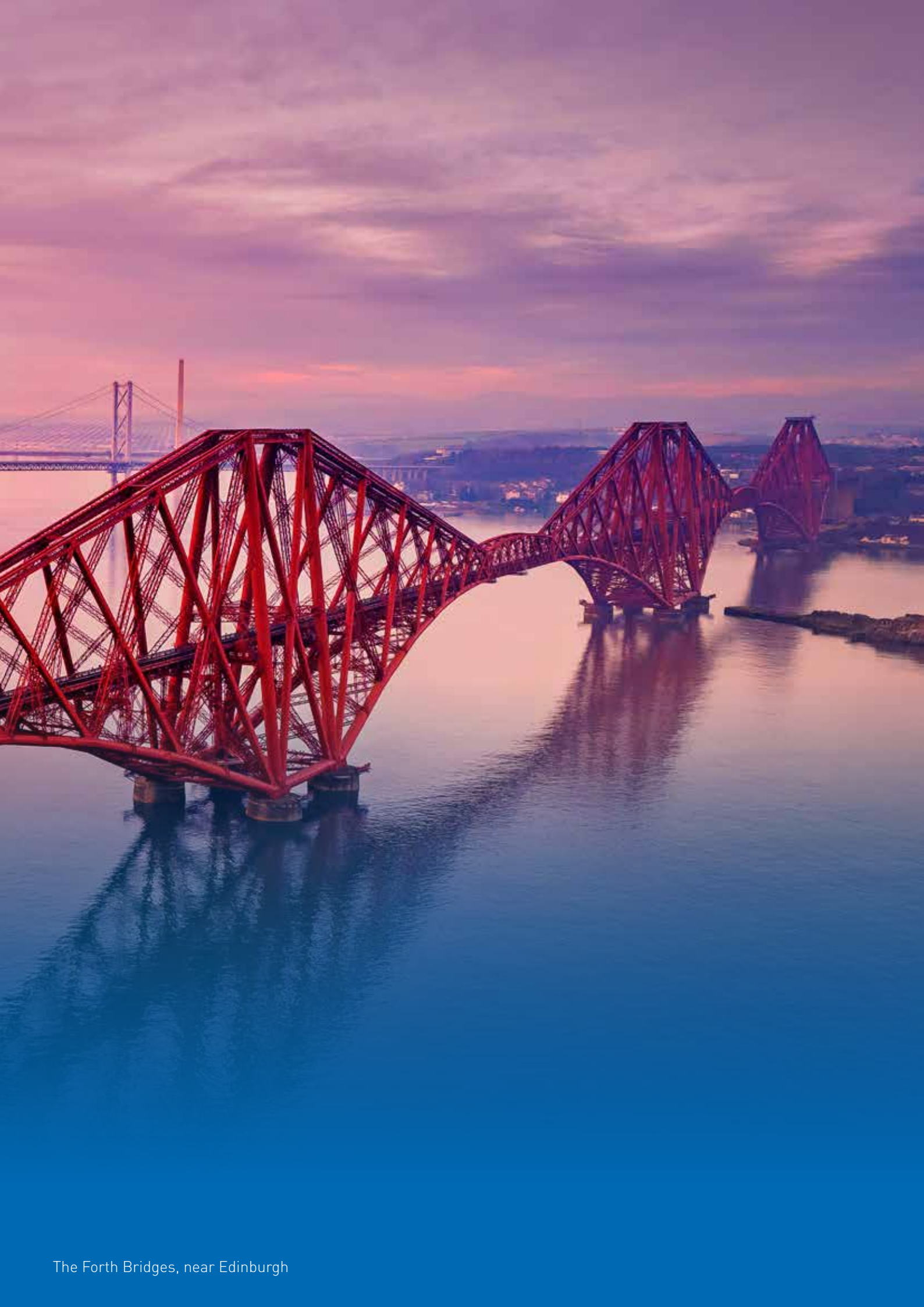
The Forth Bridges, near Edinburgh